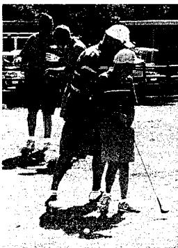
A young blind golfer gets some help at an event this past summer at the Walnut Lane course, sponsored by The Middle Atlantic Blind Golf Association. The First Tee is looking into developing curriculum for visually impaired children as part of their national program.

For more information on The First Tee, visit www.thefirstteephiladelphia.org or call 215-482-3370. For more info on Impact, visit www.impactservices.org