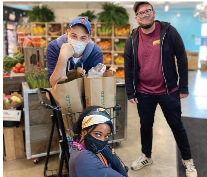
Franny Lou's Porch, Fireball Printing & Kensington Community Food Coop grew their Philadelphia business with financing from PIDC.

GET A FLEXIBLE SMALL BUSINESS LOAN TODAY